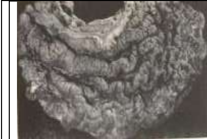
Figure 122 Nature Chronic Gastritis Specimen No. III-3.321 Reference P. 229