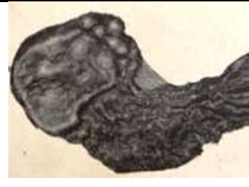
Figure 124 Nature Mucoid Carcinoma (stomach) Specimen No. III-3.556 Reference P. 229