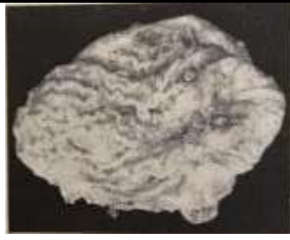
Figure 123 Nature Gastritis (atrophic) Specimen No. III-3.322 Reference P. 229