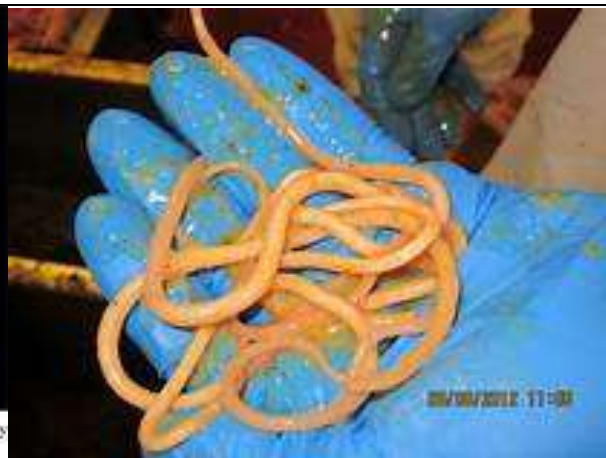
Figure 3: An ascaris present across the choledochoduodenostomy stoma